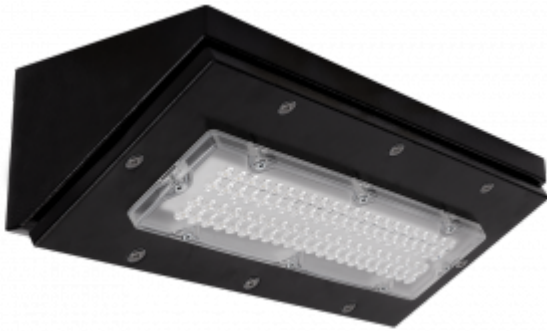
Tanek Bulkhead - Black