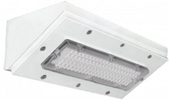
Tanek Bulkhead - White