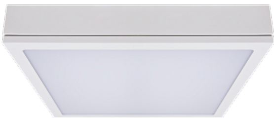
MOD Surface Complete Luminaire