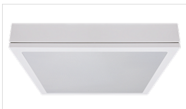
MOD UGR Surface Complete Luminaire