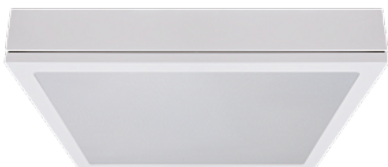
MOD UGR Surface Complete Luminaire