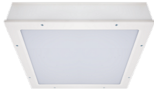
IMPS Complete Luminaire