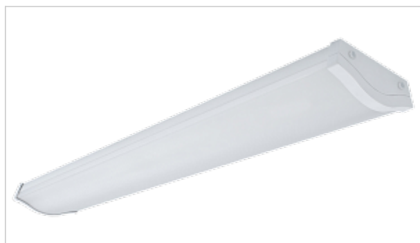
Graduate Complete Luminaire