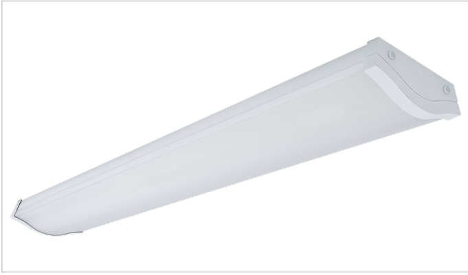
Graduate Complete Luminaire