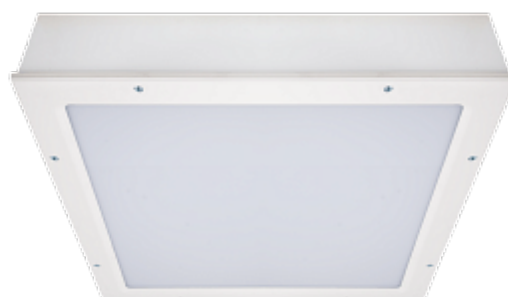
IMPS Complete Luminaire