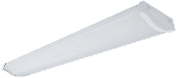
Graduate Complete Luminaire