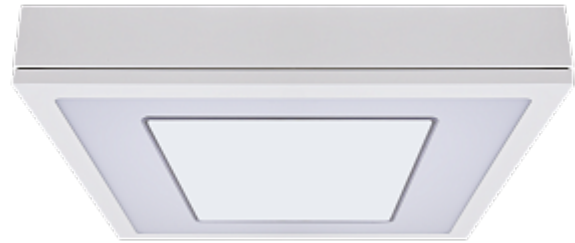
MOD Office Surface Complete Luminaire