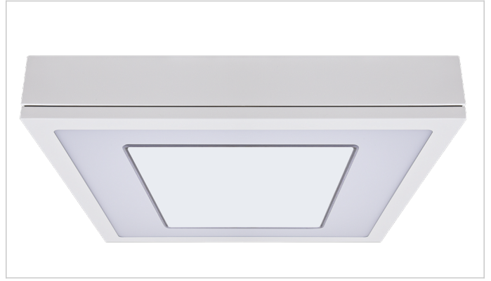
MOD Office Surface Complete Luminaire