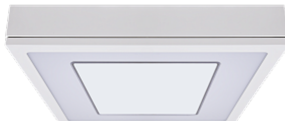
MOD Office Surface Complete Luminaire