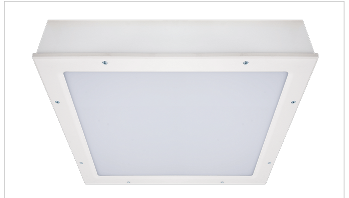
IMPS Complete Luminaire