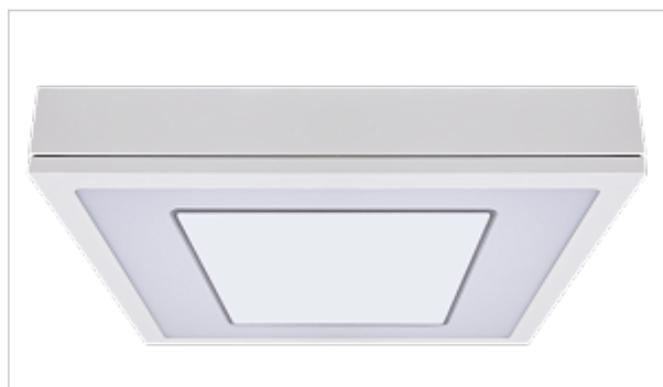
MOD Office Surface Complete Luminaire