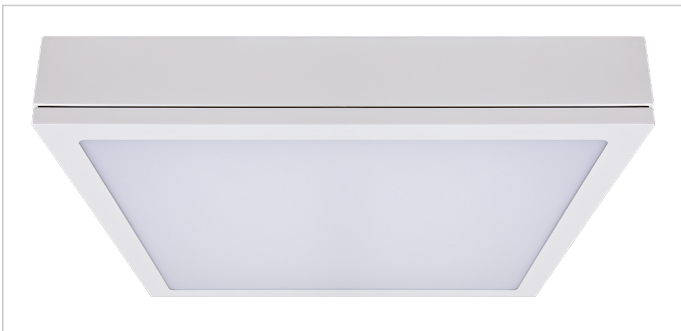
MOD Surface Complete Luminaire