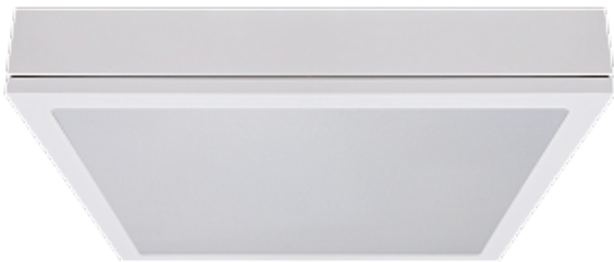
MOD UGR Surface Complete Luminaire