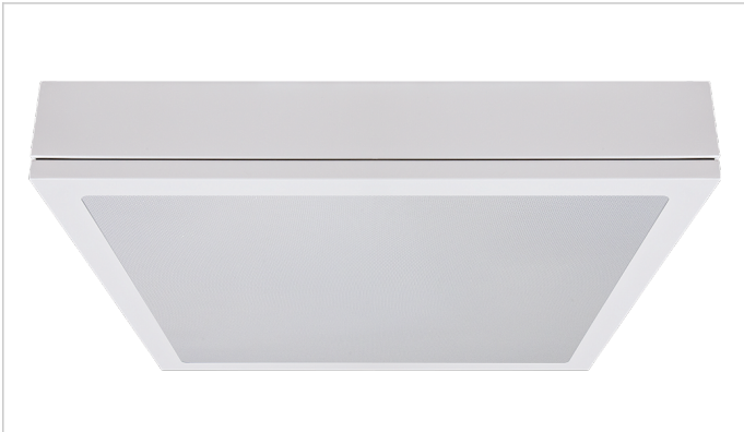
MOD UGR Surface Complete Luminaire