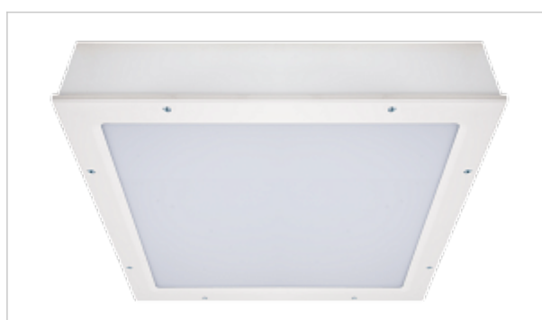
IMPS Complete Luminaire