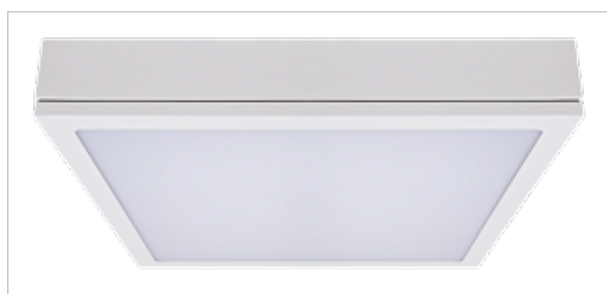
MOD Surface Complete Luminaire