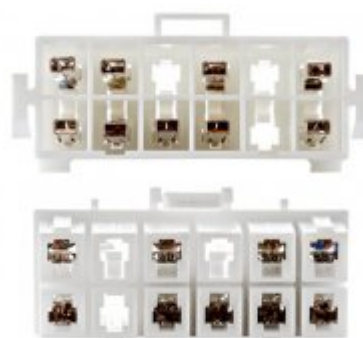
9 pole connector blocks.