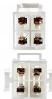
4 pole connector blocks.