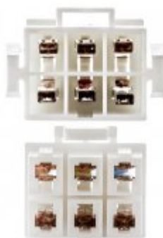
6 pole connector blocks.