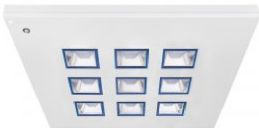
Rubix Surface Flush Blue