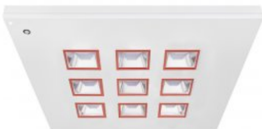
Rubix Surface Flush Red