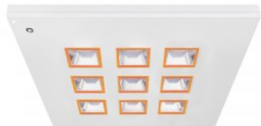
Rubix Surface Flush Orange