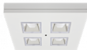
Rubix Surface Flush 300x300