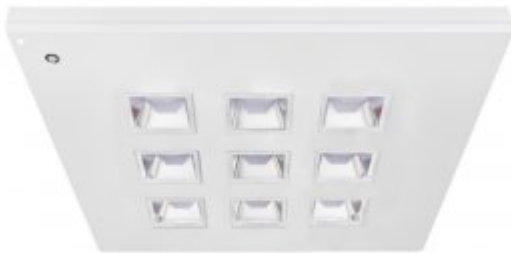
Rubix Surface Flush