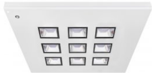
Rubix Surface Flush Black