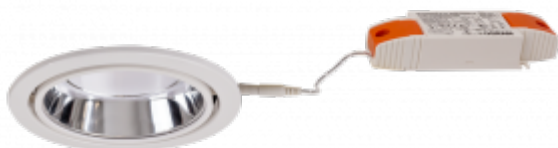
RTEC with driver