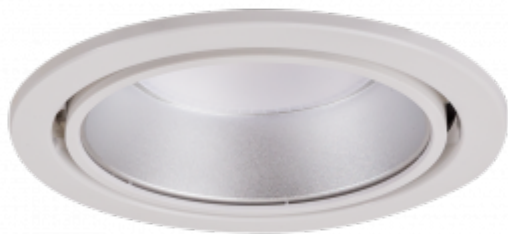
RTEC Semi Specular