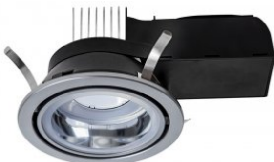
PTECD R GY WH