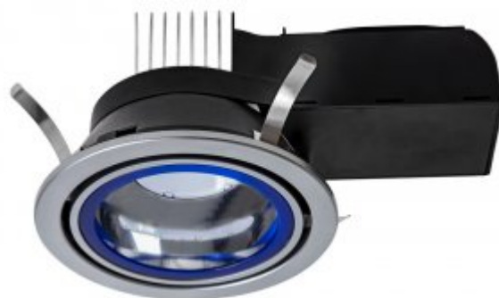
PTECD R GY BLE