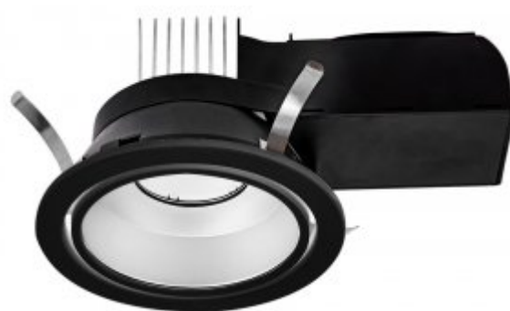
PTECD SSR BL