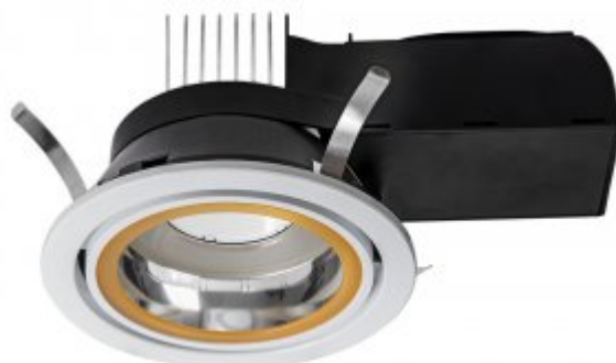
PTECD R WH ORA