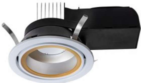
PTECD SSR WH ORA