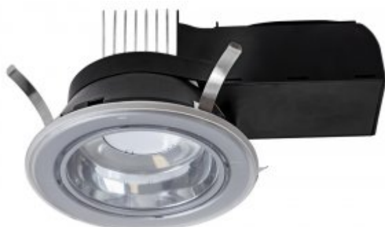
PTECD R GY + IP44