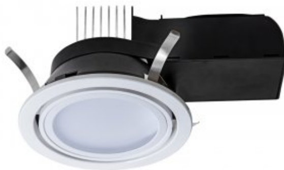
PTECD R WH OP