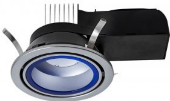
PTECD SSR GY BLE