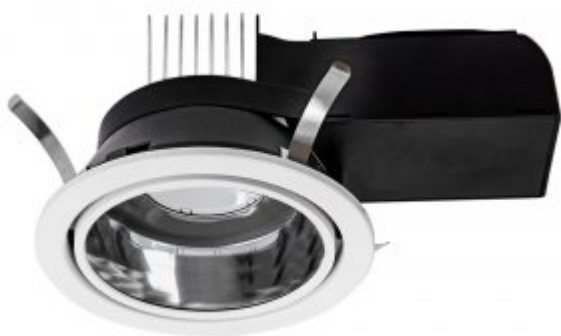
PTECD R WH