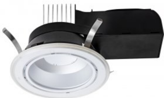
PTECD SSR WH + IP44