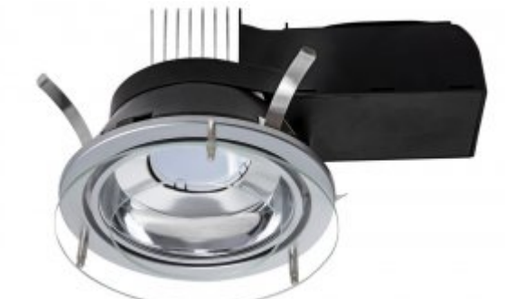
PTECD R GY DGR