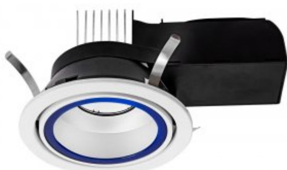
PTECD SSR WH BLE