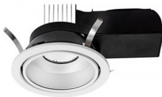
PTECD SSR WH