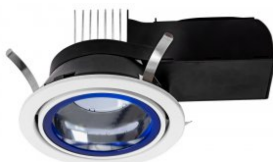
PTECD R WH BLE