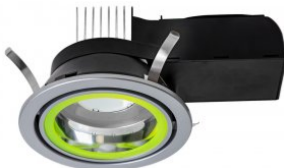
PTECD R GY GRN