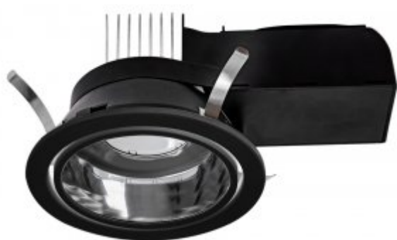
PTECD R BL