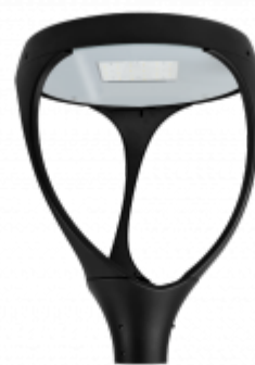
Opus 360 Black