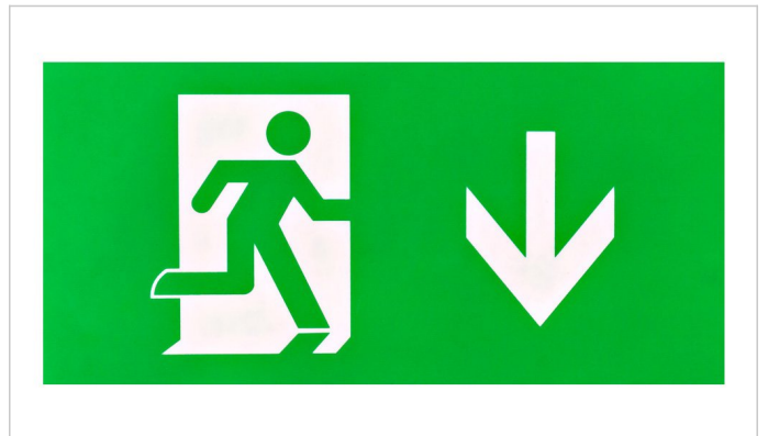
OEZ LED DL ISO7010