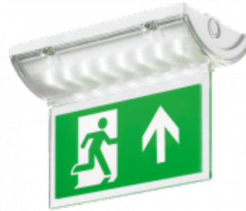
OEZ 2 with Legend