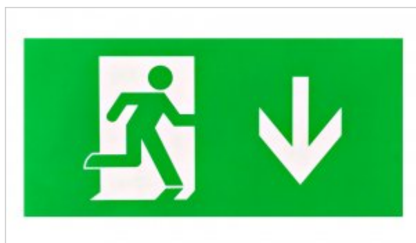
OEZ LED DL ISO7010