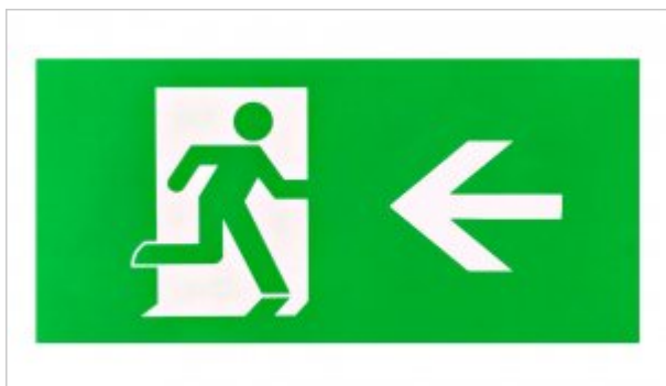
OEZ LED LL ISO7010