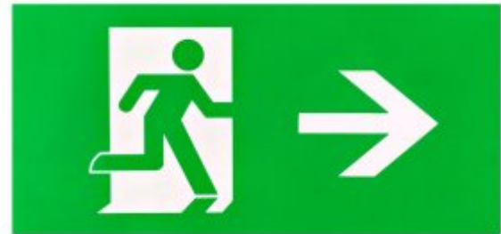
OEZ LED RL ISO7010