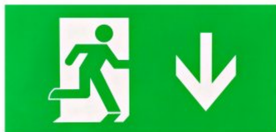
OEZ LED DL ISO7010