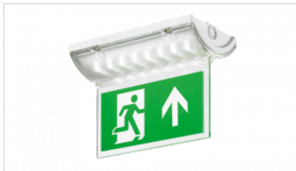
OEZ 2 with Legend