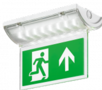
OEZ 2 with Legend