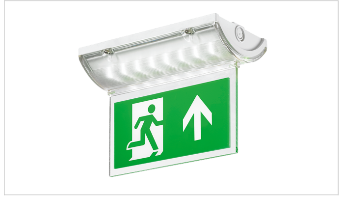
OEZ 2 with Legend