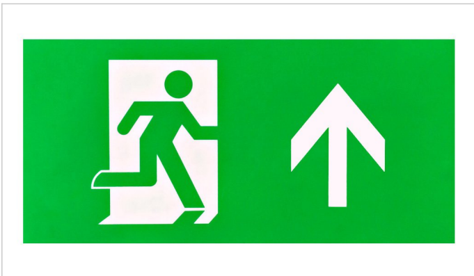
OEZ LED UL ISO7010