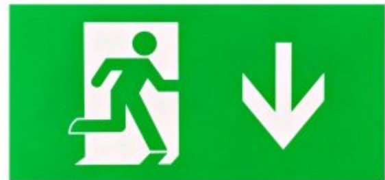
OEZ LED DL ISO7010