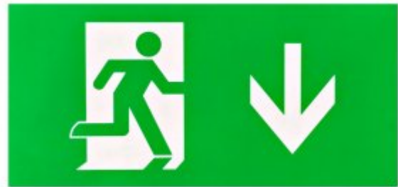
OEZ LED DL ISO7010