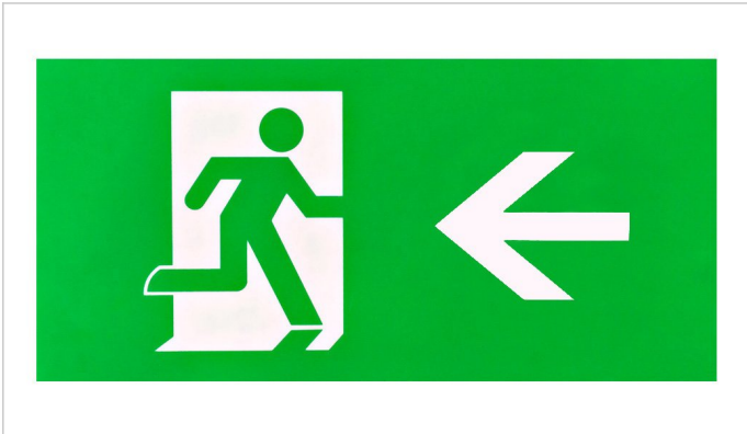
OEZ LED LL ISO7010