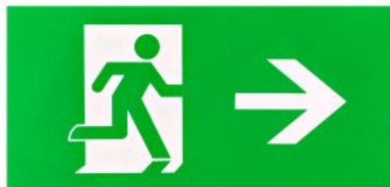
OEZ LED RL ISO7010