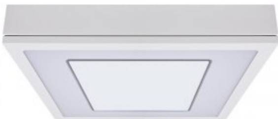
MOD Office Surface 600x600