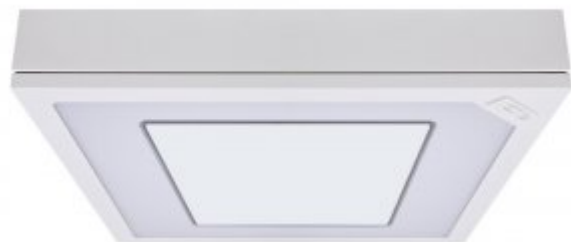
MOD Office Surface 600x600 with RAS