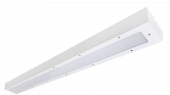
MOD Secure Surface 1500x200