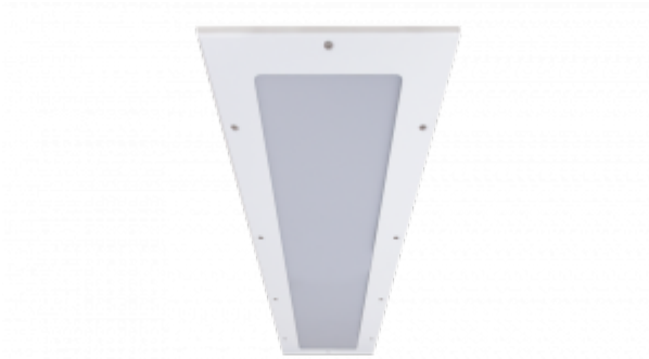
MOD Secure 1200x300