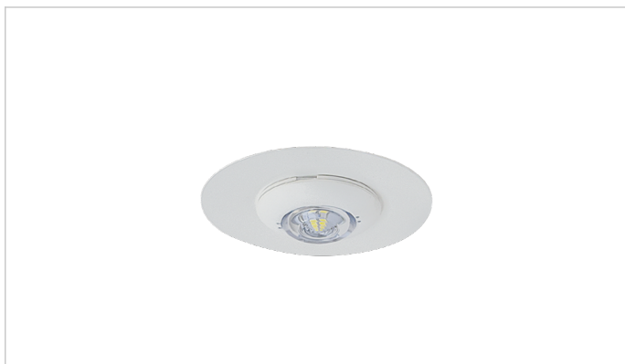
LED4 Wireless White