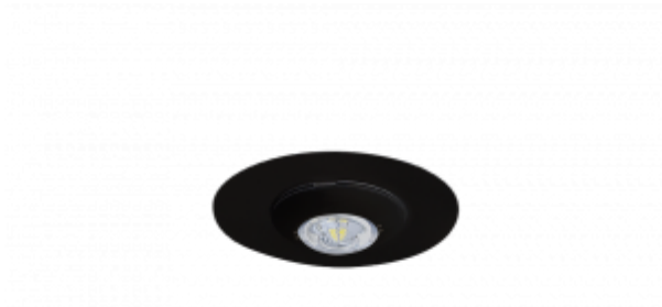
LED4 Wireless Black