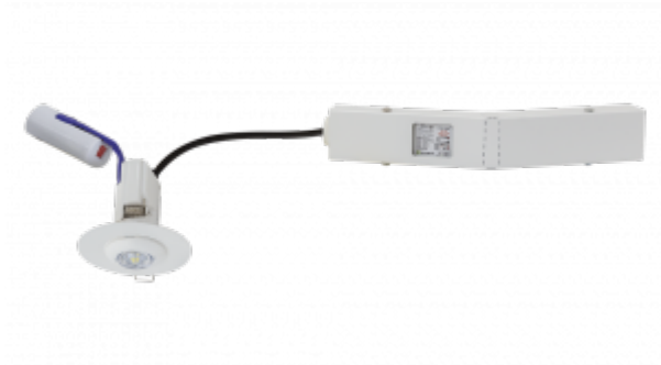
LED4 Wireless Remote Pack