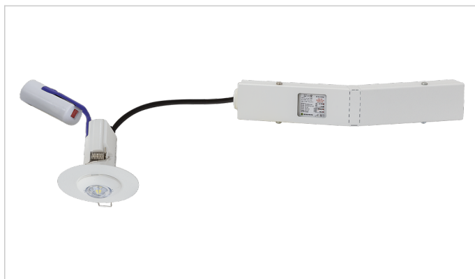
LED4 Wireless Remote Pack