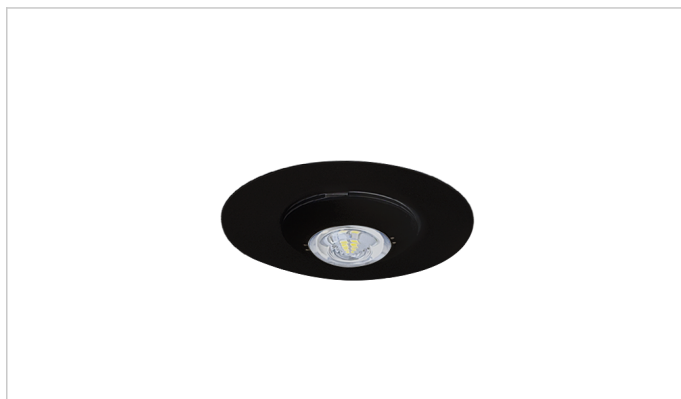
LED4 Wireless Black