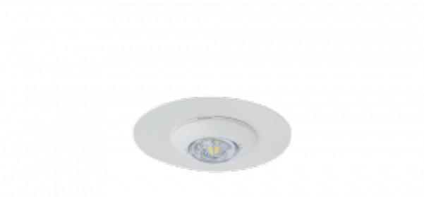
LED4 Wireless White