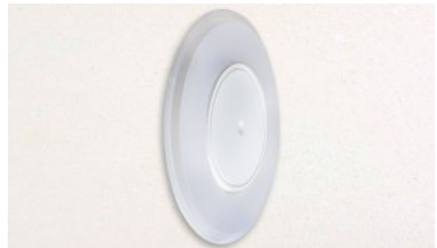
Halobay Surface Wall