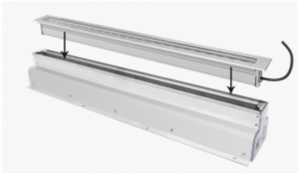
Glide In-Ground Installation