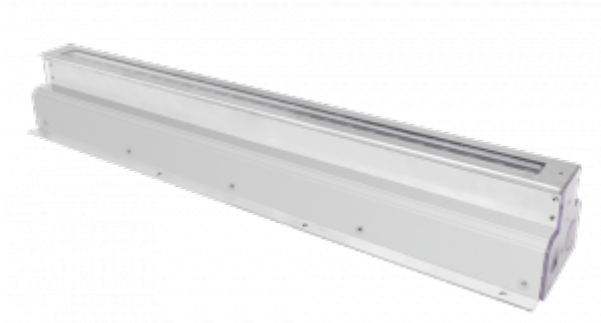
Glide In-Ground 930mm with recessing housing