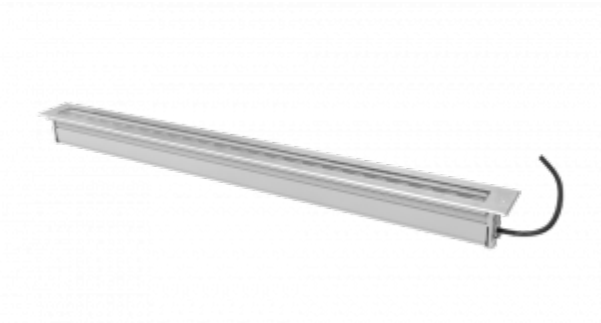
Glide In-Ground 930mm