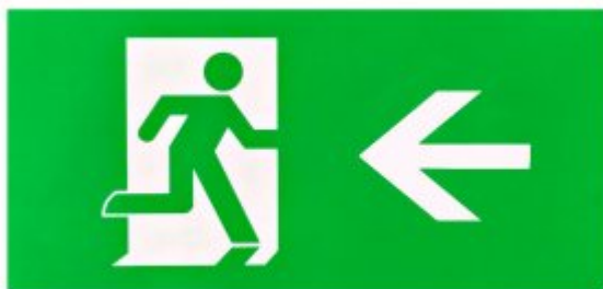
EXI3 LL ISO7010