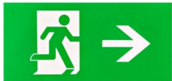
EXI3 RL ISO7010