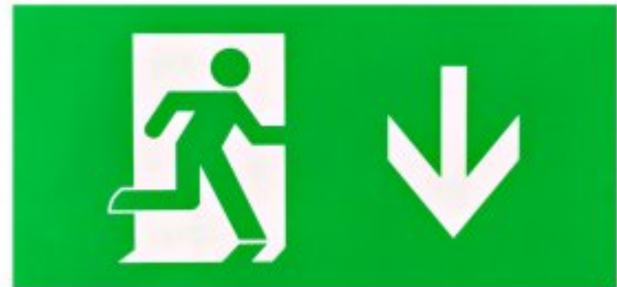
EXI3 DL ISO7010