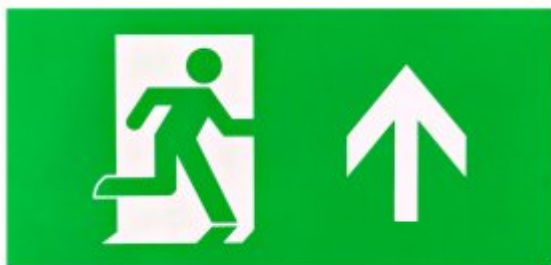
EXI3 UL ISO7010