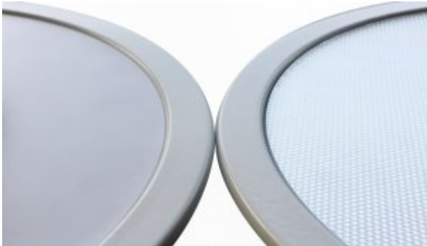
Elisian diffuser comparison