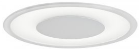
Elisian Microprism Lit