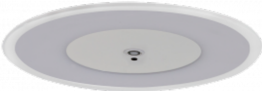
Elisian R44 and Emergency