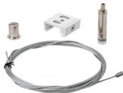
Suspension Kit Solid Ceiling