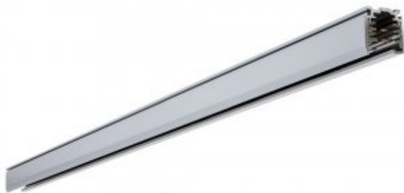
DALI Track Grey