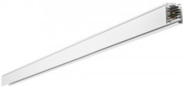
DALI Track White