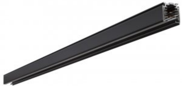
DALI Track Black