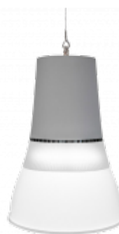
Capo XL Opal Collar