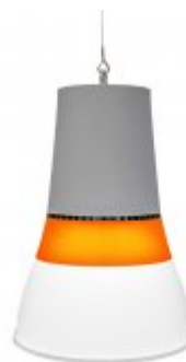
Capo XL Orange Collar