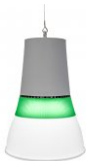
Capo XL Green Collar