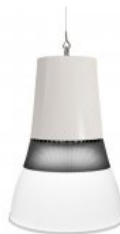
Capo XL White Housing