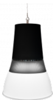
Capo XL Black Housing