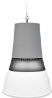
Capo XL Grey Housing