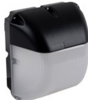
Avalon Wallpack Opal