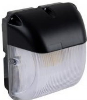
Avalon Wallpack Clear