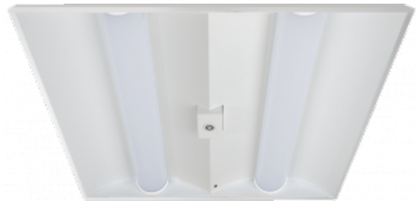
Arcus Duo R44 600x600