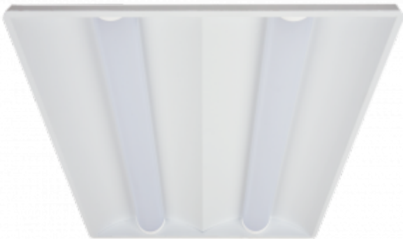
Arcus Duo 1200x600