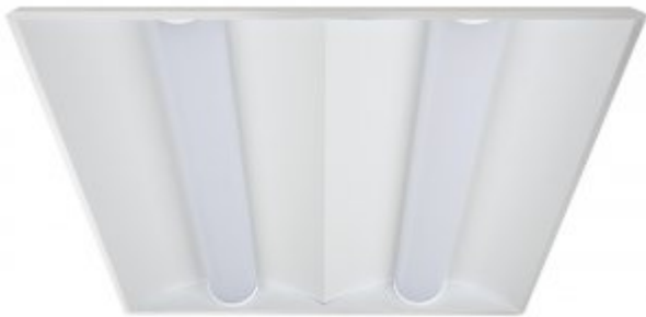
Arcus Duo 600x600