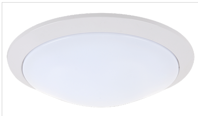
Amenity Decorative Complete Luminaire