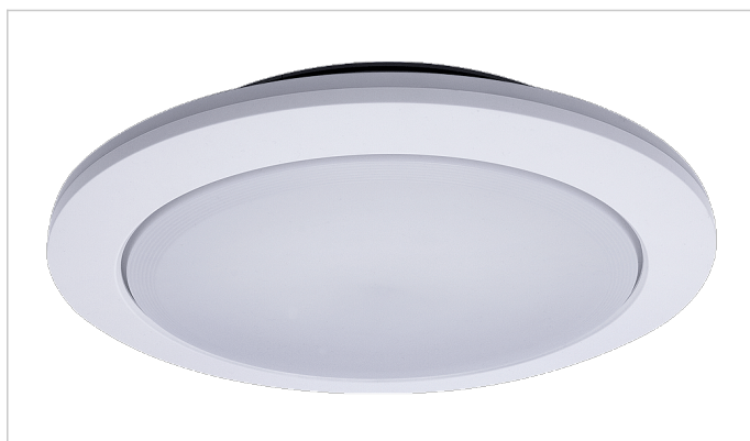
Discalo. Complete Luminaire