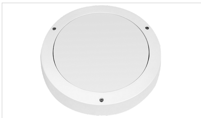
Amenity Exterior Complete Luminaire