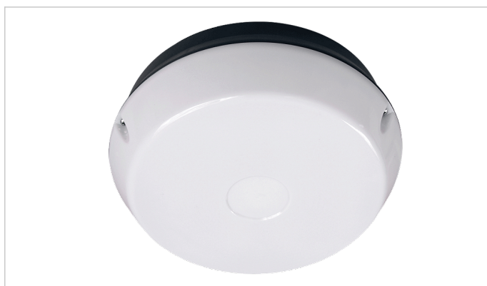
Amenity Plus Circular Complete Luminaire