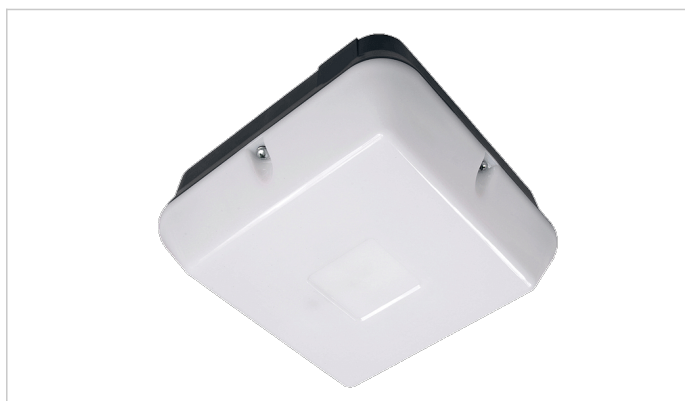
Amenity Plus Metal Complete Luminaire