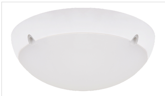
Amenity Decorative IP65 Complete Luminaire