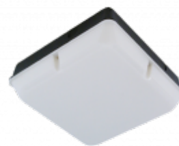
Amenity Plus Metal Square Black