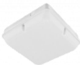
Amenity Plus Metal Square White