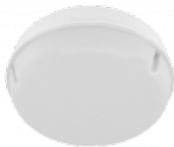
Amenity Plus Metal Circular White