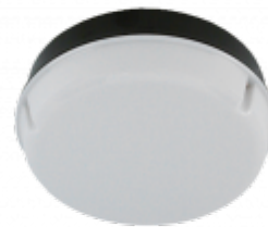
Amenity Plus Metal Circular Black