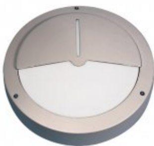
Amenity Exterior With Silver Eyelid