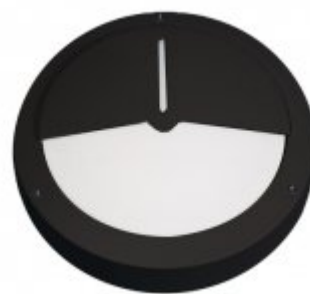
Amenity Exterior With Black Eyelid