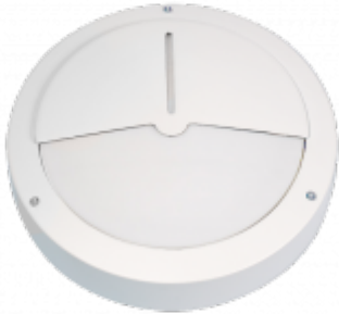
Amenity Exterior With White Eyelid