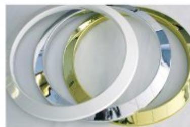
Amenity Decorative Rings