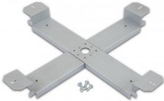
Amenity Decorative Halo Recessing Kit