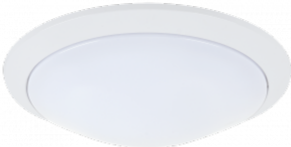
Amenity Decorative Halo