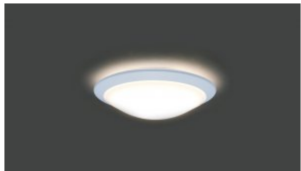
Amenity Decorative Halo Lit