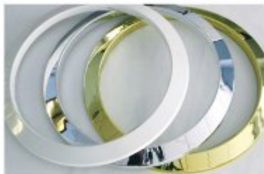
Amenity Decorative Halo Rings