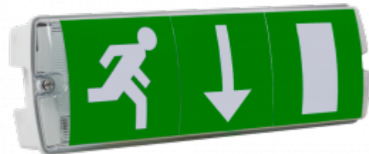
AME Wireless with Legend