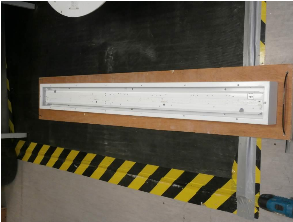
Figure 2. Test Setup