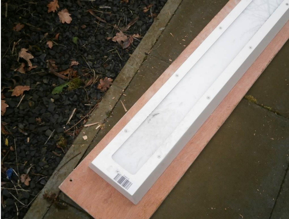
Figure 3. Product Image after the test