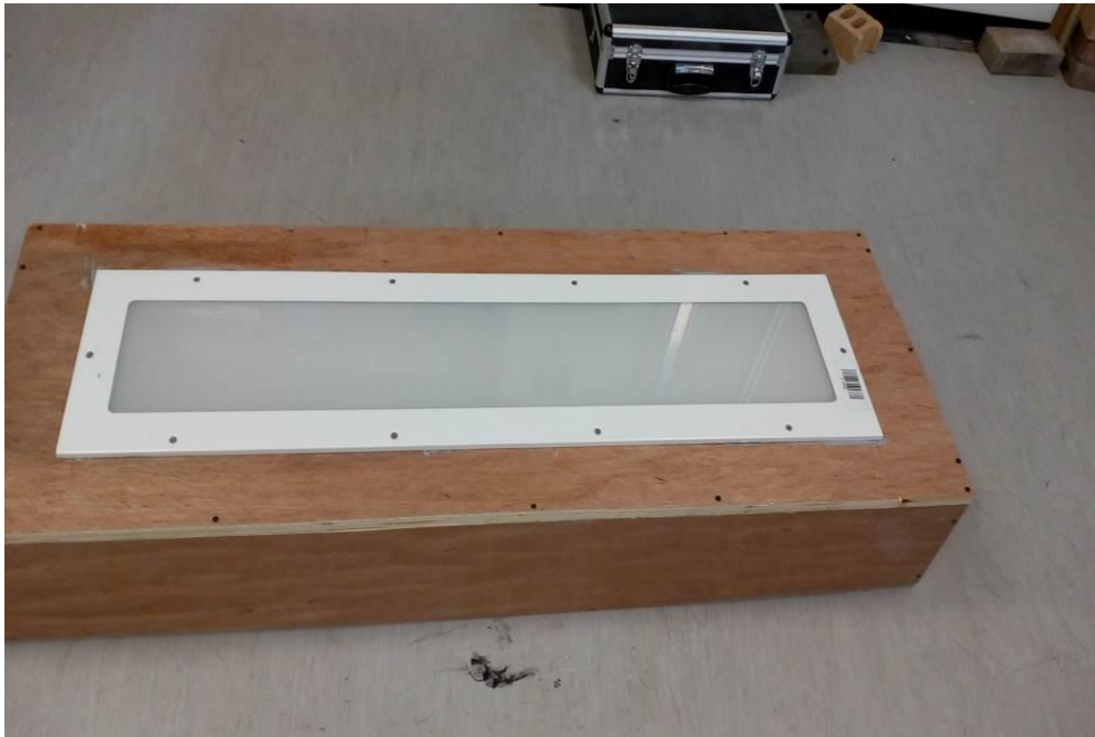
Figure 2. Test Setup