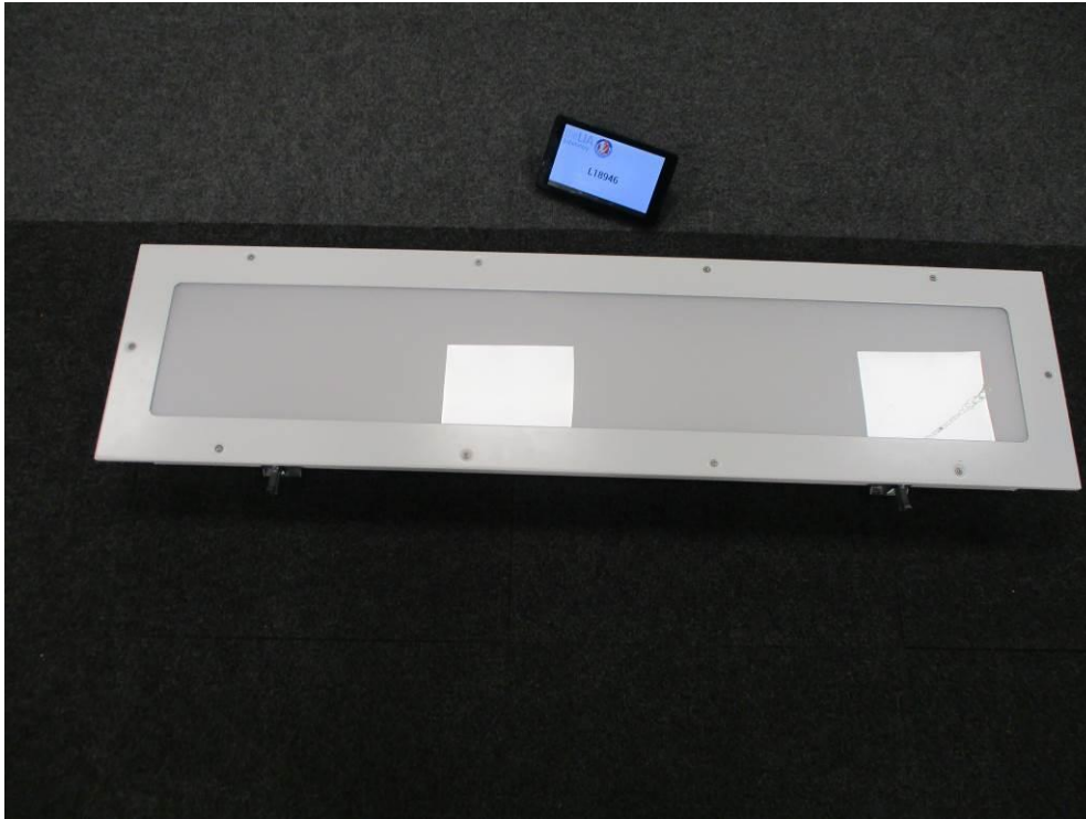
Figure 1. Product Image