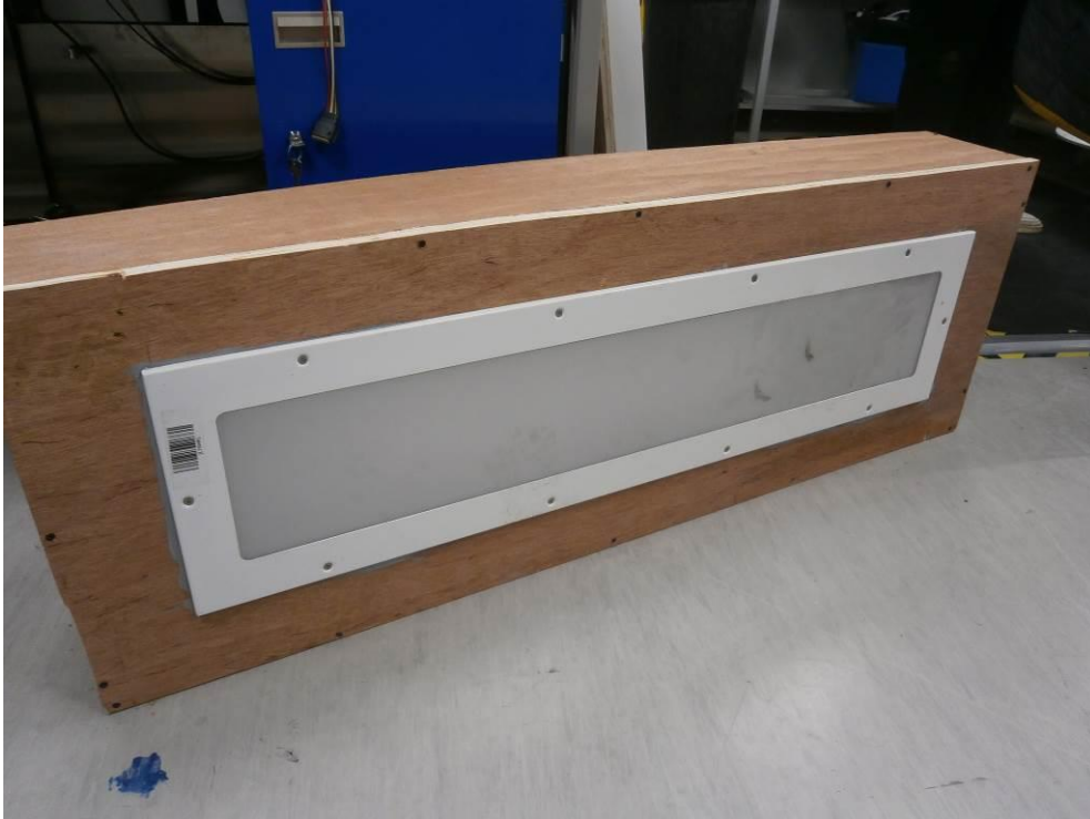
Figure 3. Product Image after the test