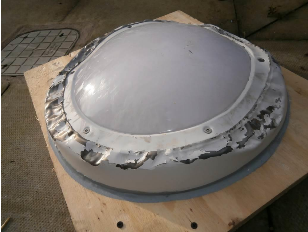
Figure 3. Product Image after the test