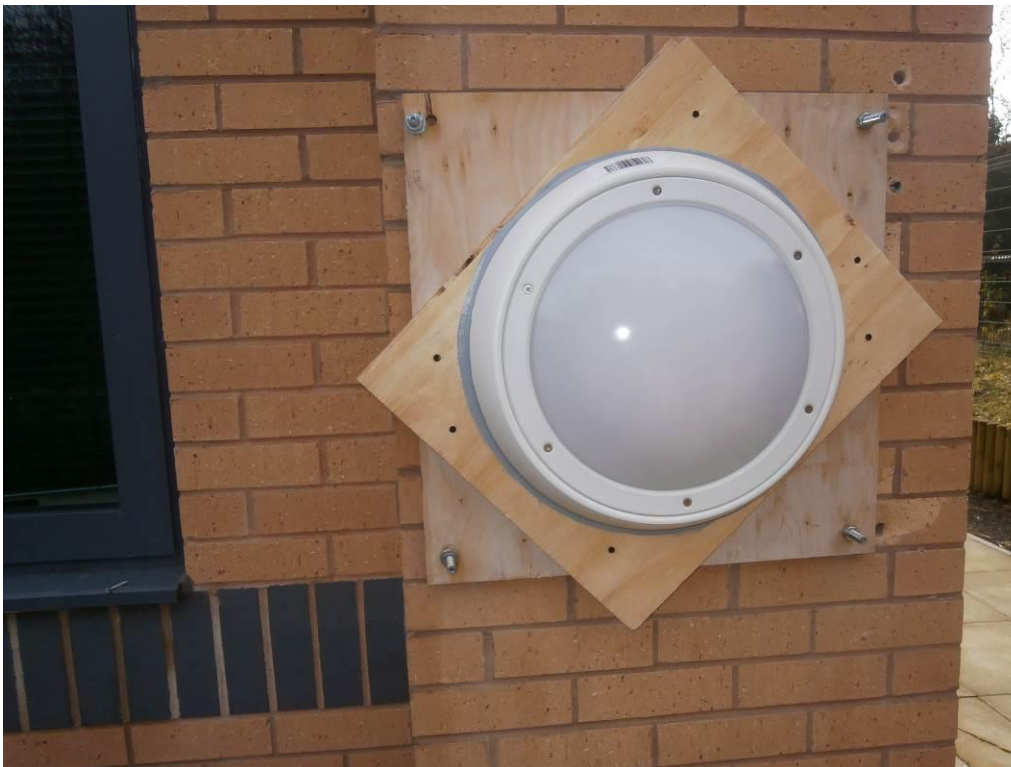
Figure 2. Test Setup