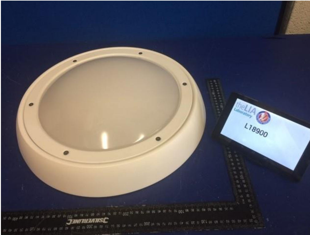
Figure 1. Product Image